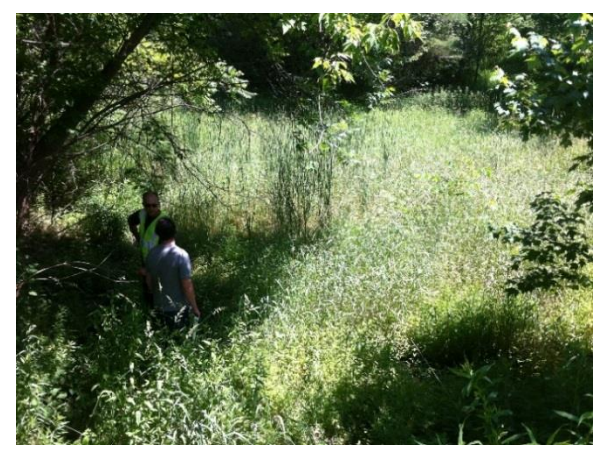
Figure 6: Fairview Dr. natural detention area (6/27/14)

The proposed retrofit is to convert the natural depression to a gravel wetland with water quality