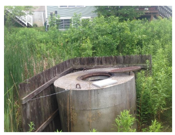
Figure 4: The Commons North Pond Outlet Structure

The proposed retrofit for this pond involves conversion of the pond to an underground storage chamber system, and leveling to ground level to provide additional backyard space. A less costly alternative option, is to convert the wet pond to an expanded gravel wetland with aesthetic improvements including a new outlet structure and landscaping features, sized to mitigate the CPv storm volume.