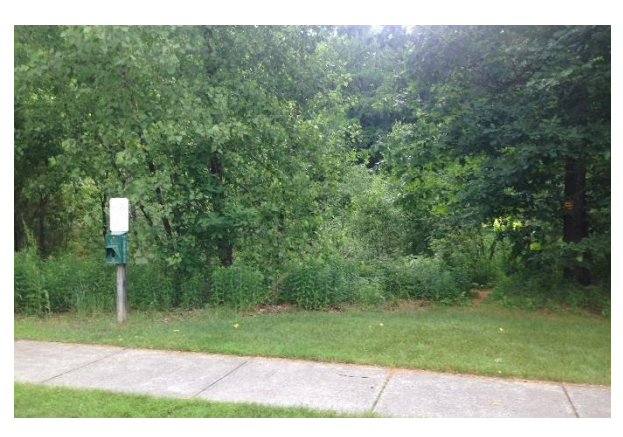
Figure 5: View of proposed retrofit site from roadway.

Detention pond 139, located in the wooded area, just off Syndey Drive is currently covered under permit #1-1186 for the Woodlands development. The detention pond was designed with a flow splitter from Sydney Drive, intended to route a majority of the flow to the detention pond, and overflow to an outfall behind The Commons Condos. The flow splitter has been observed to not function as designed, and most of the flow is diverted to the outfall, with direct discharge to the stream. A proposed retrofit study was completed by Lamoureux and Dickinson in 2007, resulting in a design to