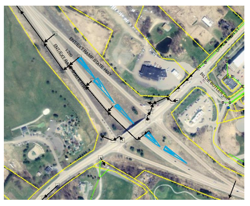
Figure 9: I-289 Exit Ramp with proposed retrofit.

The I-289/Route 15 Exit Ramp was identified potential as а opportunity to manage runoff from primarily VTRANS owned Two sand filter impervious. systems were proposed in the median on the North and South side of the Route 15 overpass (Figure 9). The proposed practice is an approximately 4' deep sand filter, with a 4" underdrain, and 1.5' surface ponding depth before passing over a weir. The system is designed to provide storage for the CPv volume. The low-flow orifice and sand filter provide extended filtration, which provides water quality benefit.